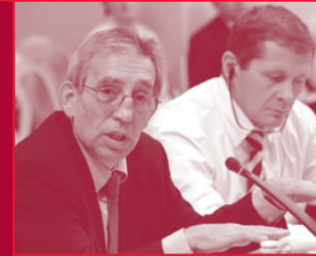
Russian State Duma hearing on HIV/AIDS, organized by TPAA, with members of the Council of Europe Parliamentary Assembly and UK Parliament