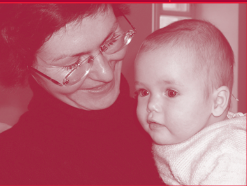
TPAA staff visits orphanage for children born to HIV-positive mothers during a research visit to Irkutsk, Russia.

Transatlantic Partners Against AIDS (TPAA) is fighting the spread of HIV/AIDS and saving lives in Russia and Ukraine.