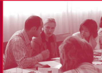
TPAA provides human resource managers at Unilever with training on HIV/AIDS-related workplace policies and prevention programs.