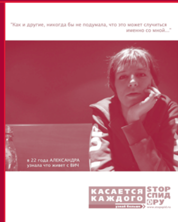
Image from TPAA's StopSPID (Stop AIDS) mass media campaign, developed jointly with Russian and Ukrainian media companies, state agencies, and international partners.